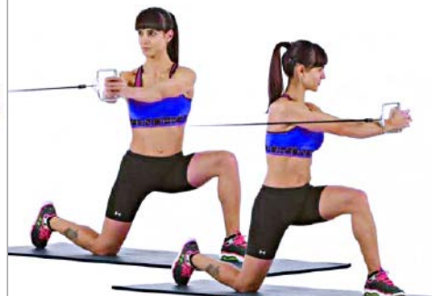
ROTACIONES POLEA O GOMA 2 x 10 x LADO