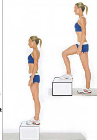
SUBIDAS CAJÓN 2 x 10 por pierna