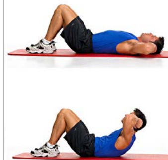
ABDOMINALES 3 x 20