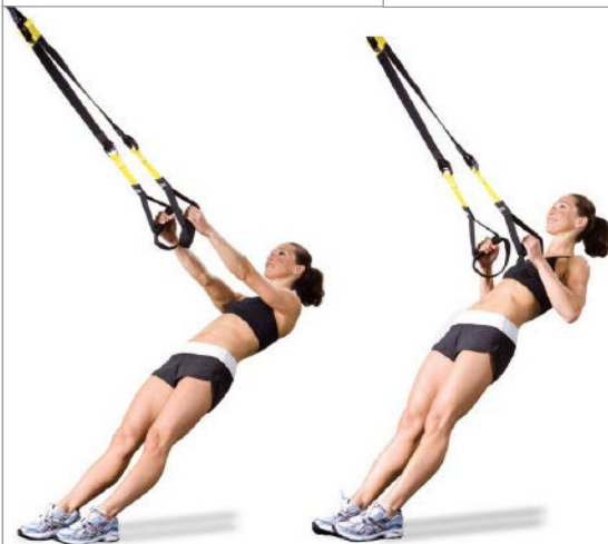
REMO TRX o JALÓN 3 x 10