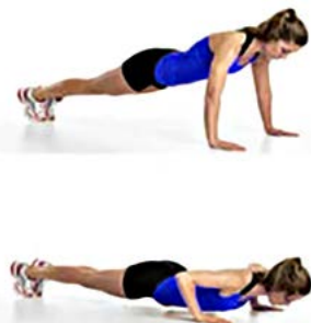
FONDOS 3 x 10