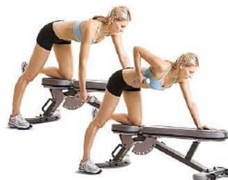
REMO 1 MANO 2 x 10 x mano