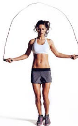
COMBA 5 x 40"/20"