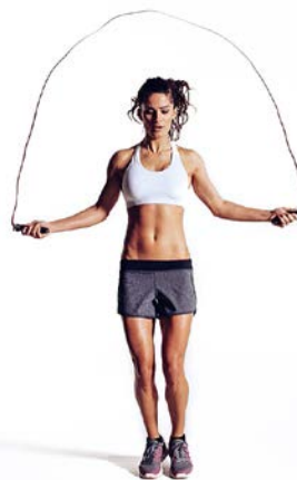
COMBA 5 x 40"/20"