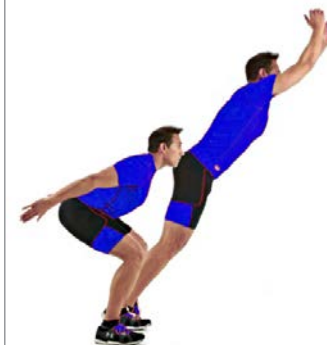
SALTO HORIZONTAL 6 x 6