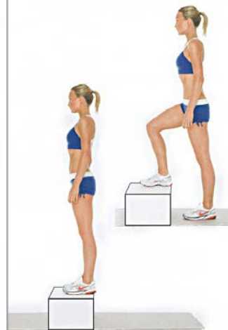
SUBIDAS CAJÓN 2 x 10 por pierna