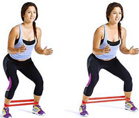
PASOS LATERALES GOMA 2 X 10 X LADO