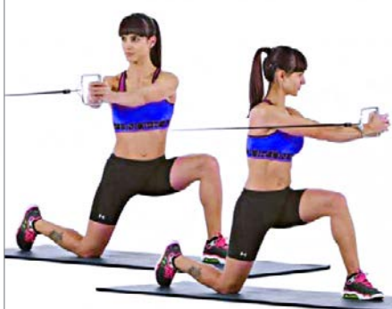
ROTACIONES POLEA O GOMA 3 x 10 x LADO