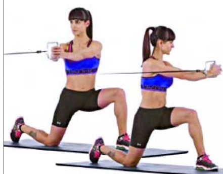
ROTACIONES POLEA O GOMA 3 x 10 x LADO