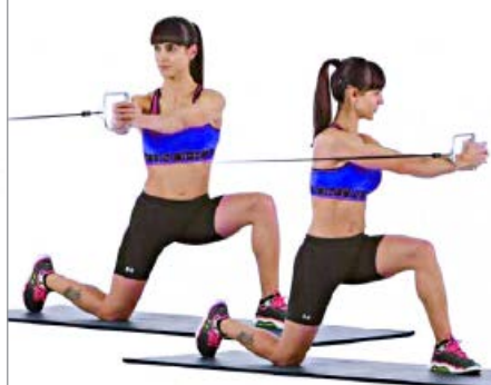
ROTACIONES POLEA O GOMA 3 x 10 x LADO