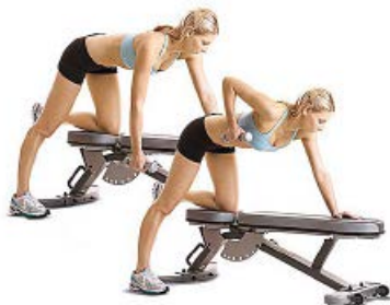
REMO 1 MANO 2 x 10 x mano