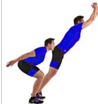
SALTO HORIZONTAL 6 x 6