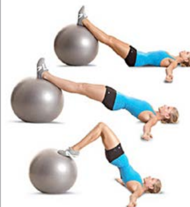
PELVIC CURL 3 x 10