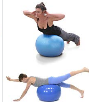
LUMBARES FITBALL 3 X 10