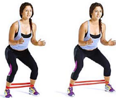
PASOS LATERALES GOMA 2 X 10 X LADO