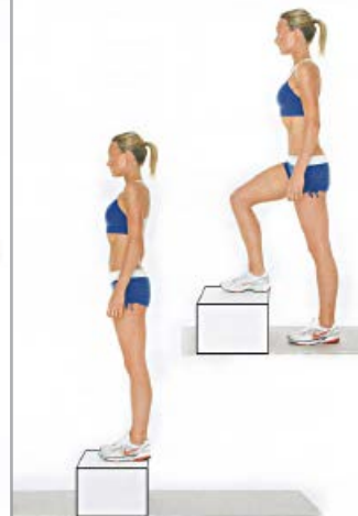
SUBIDAS CAJÓN 2 x 10 por pierna