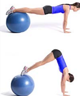
ABS FITBALL 3 x 10