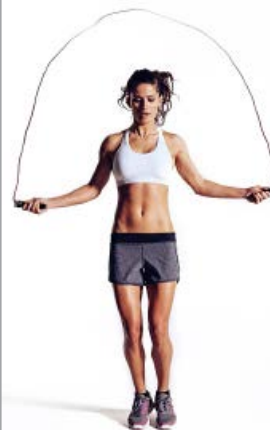
COMBA 5 x 40"/20"